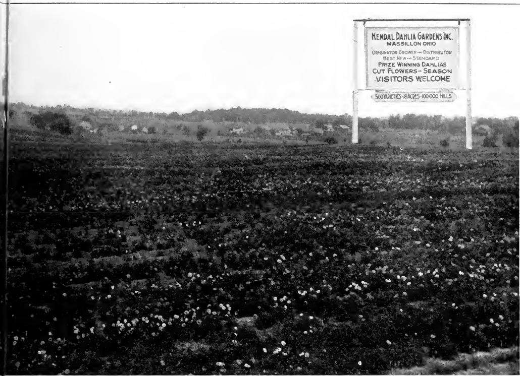
31 from 35 feet elevation of housetop on east side of gardens. Sign is inset. KE IN THE WHOLE GARDENS

erect stems. A sturdy grower and a free bloomer with full centers to the end of the season. Blooms often 10 inches in diameter, 4\frac{1}{2} inches deep; bush 5 to 6 feet in height. A cut flower, garden or exhibition variety with Certificates of Merit and high score and a prize winner. $2.50 each, Plants, $1.25.